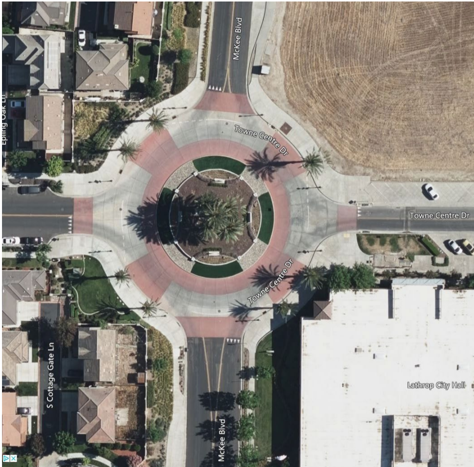
① Towne Centre Drive and McKee Blvd