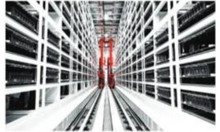
Tesla opened another California facility, a utility scale battery manufacturing plant to produce the company's largest energy storage unit — the Megapack.

Tesla also opened an additional California facility in the City of Lathrop, another TeamCalifornia member,