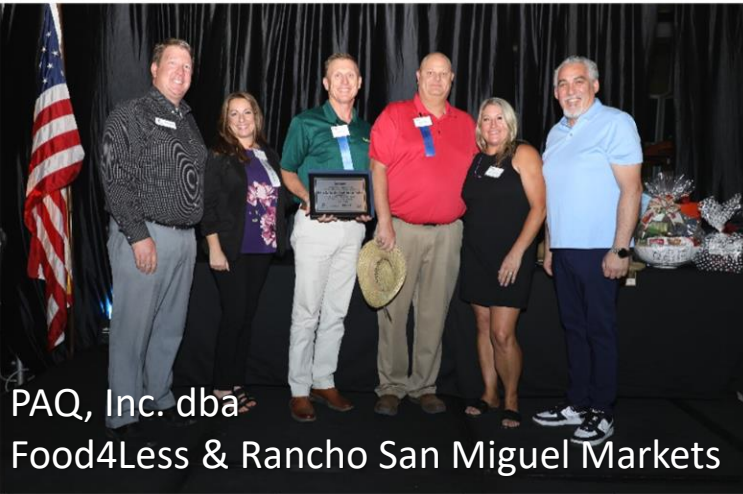
PAQ, Inc. dba Food4Less & Rancho San Miguel Markets