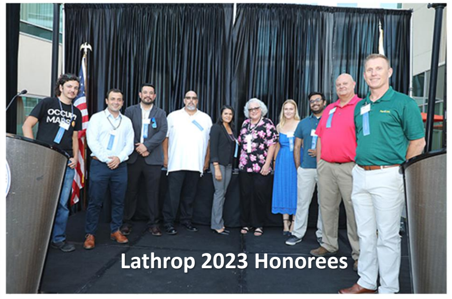
Lathrop 2023 Honorees