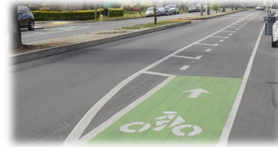
CLASS I SHARED-USE PATHS