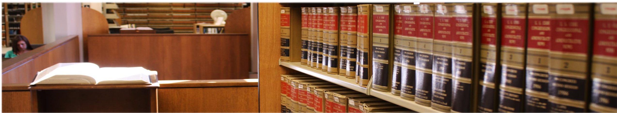
Image: Law Books in Law Library

Continue to support development within Lathrop through legal support of staff working on adopted and proposed projects including: entitlements, development agreements, special district formations, subdivision improvement agreements, and SB5 compliance.