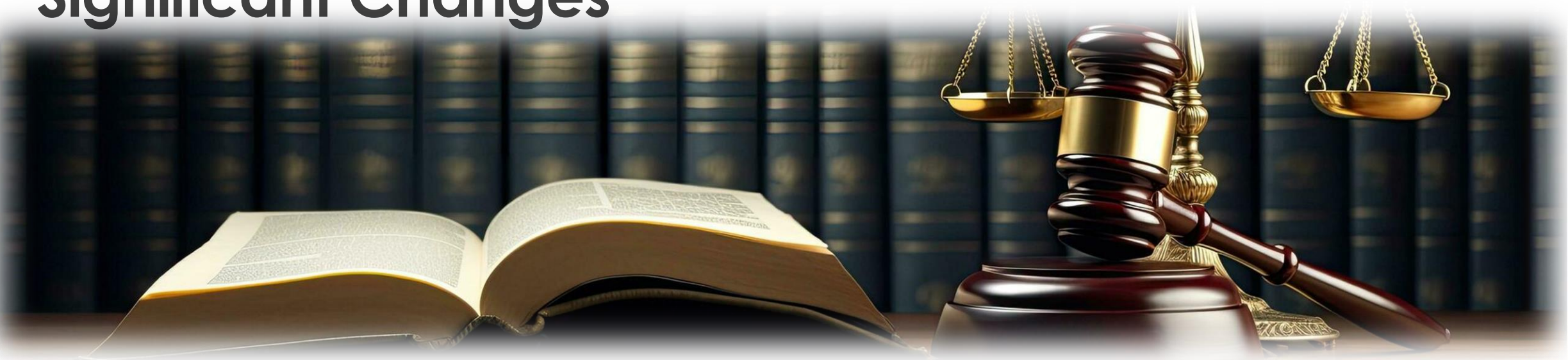
Image: Law Books with Gavel