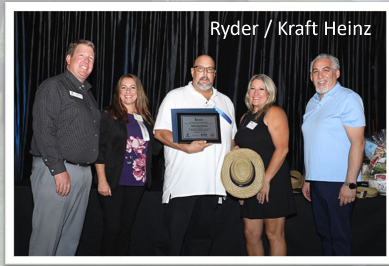
Ryder / Kraft Heinz