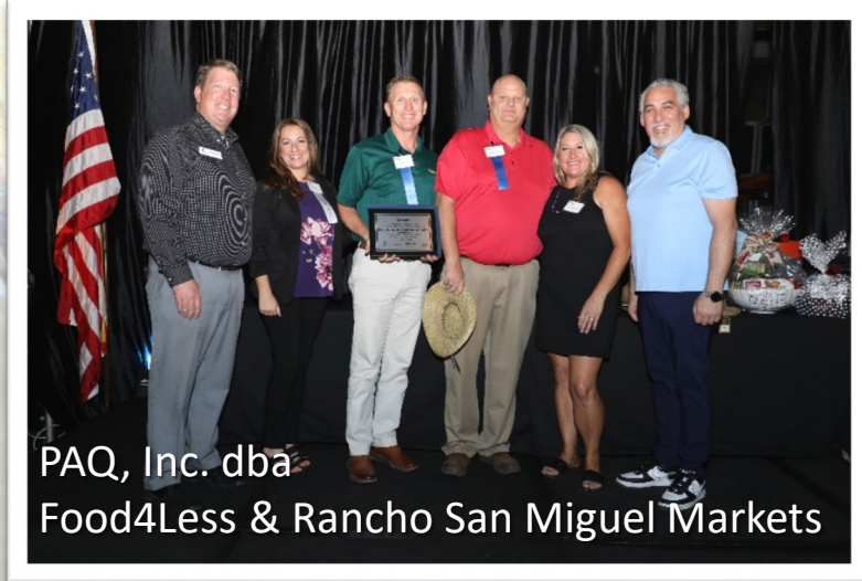
PAQ, Inc. dba Food4Less & Rancho San Miguel Markets