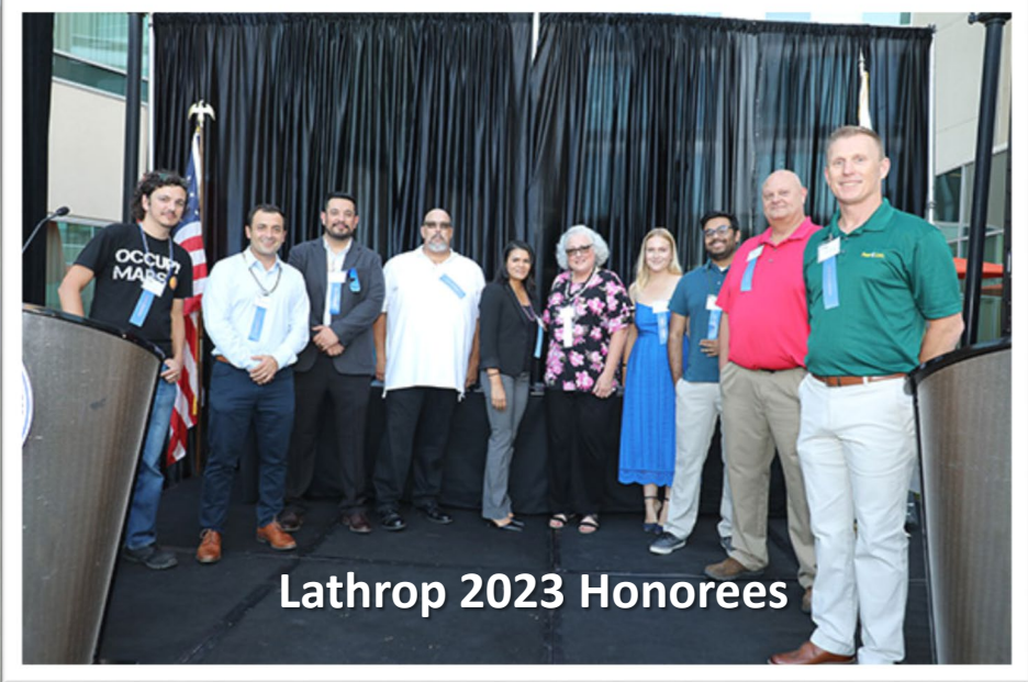
Lathrop 2023 Honorees