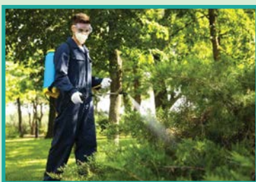
Pest control professional