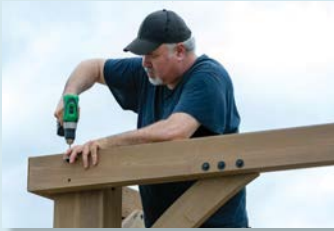
Man drilling wooden board

To avoid delays or unexpected issues, we encourage you to consult with the knowledgeable staff at the City of Lathrop’s Planning & Building Divisions prior to starting any seasonal home improvements, such as landscape, electrical, or plumbing upgrades. Staff are available to clarify permit requirements and will help you determine whether your specific project requires formal approval.