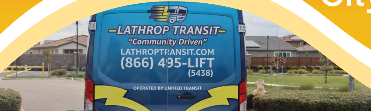
Lathrop Transit Van