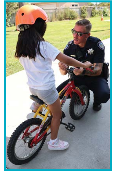
Officer talking to bicyclist

Residents are encouraged to use their driveways and garages, when possible, to reduce street congestion and improve neighborhood aesthetics.