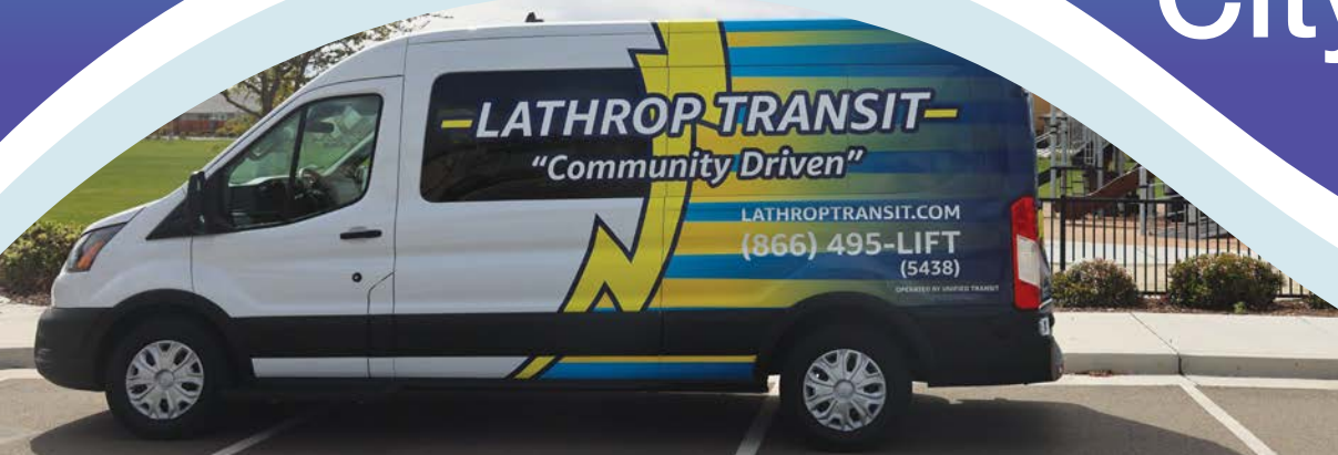
Lathrop Transit Van