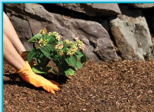
Hands planting flowers