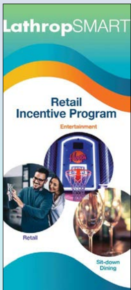
Retail Incentive Program Brochure

Thinking about starting a new retail or entertainment business? The Lathrop City Council approved a new incentive program aimed to attract new retailers, entertainment, and recreational businesses to underserved areas east side of Interstate 5. The LathropSMART Retail Incentive program offers financial assistance in the form of a credit-based grant payable toward city fees related to business license, tenant improvements of an existing building or space, or construction of a new building. Eligible business categories include retail establishments that sell goods to consumers and patrons; full-service restaurants, entertainment and recreational entities; and small businesses retailers, entertainment, or recreational entities with at least 3 full-time employees. The initiative excludes home businesses, mobile vendors, and industries focused primarily on fuel, alcohol, tobacco, or cannabis. For more information about the Retail Incentive Program, scan the QR Code to visit the City's website or contact the Economic Development Administrator at (209) 941-7221 or by email at EconDev@ci.lathrop.ca.us .