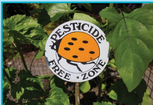
Pesticide Free Zone sign

A simple way to help keep pesticides out of the local waterbodies is to reduce the amount of chemicals you apply to your yard and garden. To do this, while managing