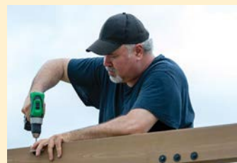
Man drilling wooden board

Avoid the surprise and frustration of a home improvement or landscaping project, by contacting the friendly and informative staff of the City's Planning and Building Divisions first. Staff is available to explain the requirements of your specific project and whether or not a building permit is required. Visit City Hall during normal business hours (8 a.m. to 6 p.m. Monday through Thursday and 8 a.m. to 5 p.m. on Friday) or by emailing or calling planning@ci.lathrop.ca.us , (209) 941-7260, or building@ci.lathrop.ca.us , (209) 941-7270.