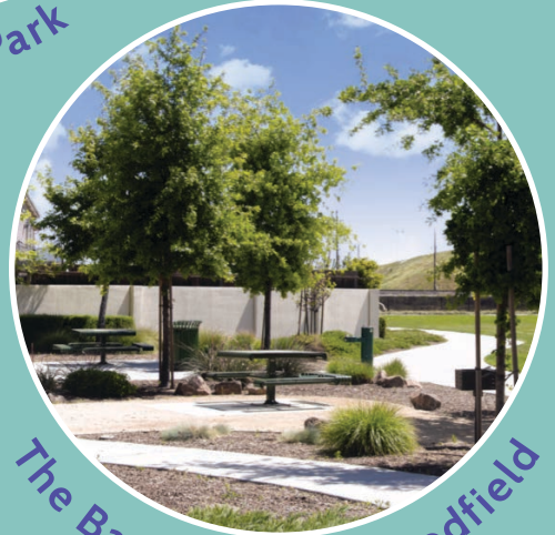
The Basin Park at Woodfield