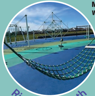
River Park North