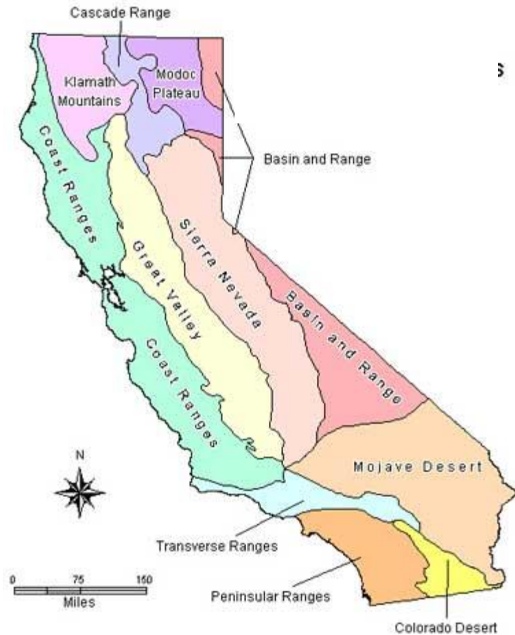
Figure 1. California Geomorphic Provinces

Alternatively, the Permittee may use a geomorphically based hydromodification standard or set of standards and analysis procedures designed to ensure that Regulated Projects do not cause a decrease in lateral (bank) and vertical (channel bed) stability in receiving stream channels. The alternative hydromodification standard or set of standards and analysis procedures must be reviewed and approved by the Regional Board Executive Officer.